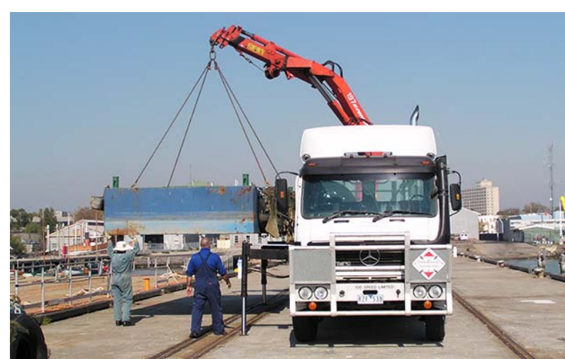
Crane Truck unloading a 6m Steel pontoon