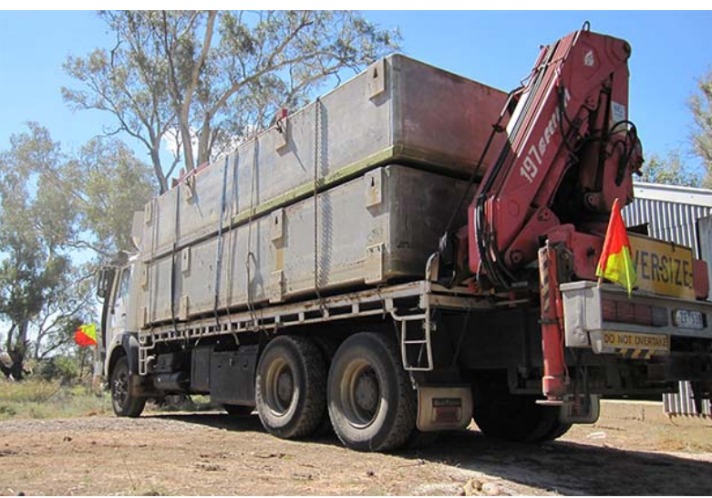
Crane Truck loaded with two 6m Aluminium pontoons