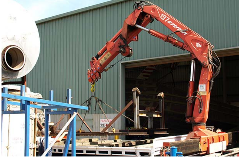
Crane Truck relocating boat cradle at the company's workshop

Korevaar Marine Group Pty Ltd 127 Nelson Place, Williamstown, VIC 3016 Ph: 03 9397 6678 Fax: 03 9397 7532 Email: kmgweb@korevaar.com.au